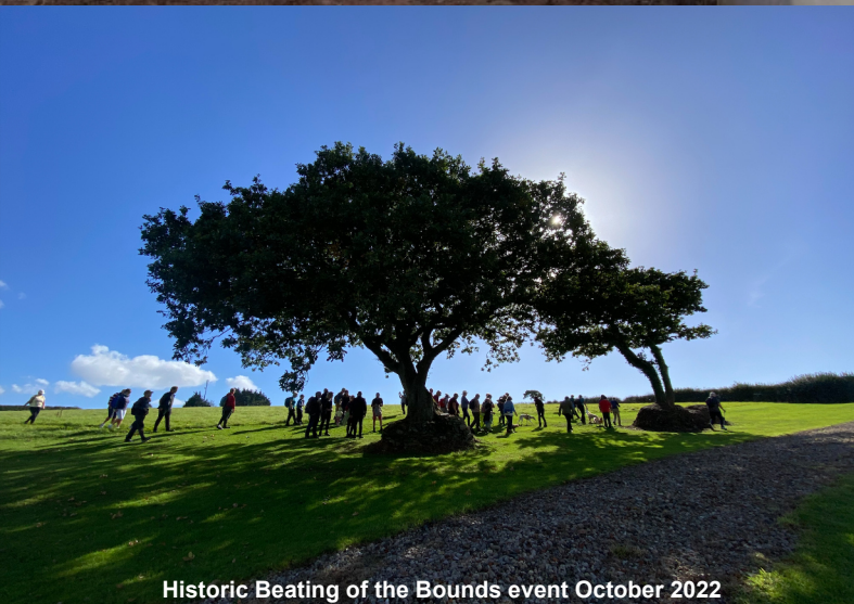
Historic Beating of the Bounds event October 2022