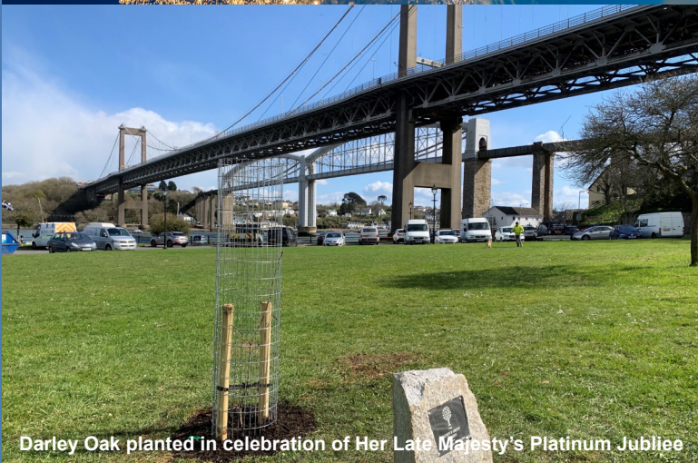
Darley Oak planted in celebration of Her Late Majesty's Platinum Jubilee