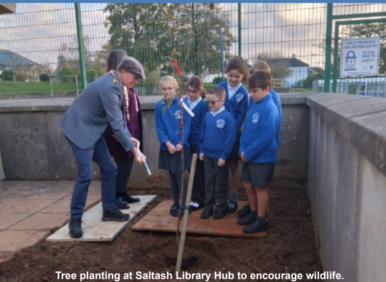
Tree planting at Saltash Library Hub to encourage wildlife.

Did you know your Councillors are on Fore Street for Meet your Councillors every second Saturday of the month outside Bloom Hearing Specialists. Come and give us your views.