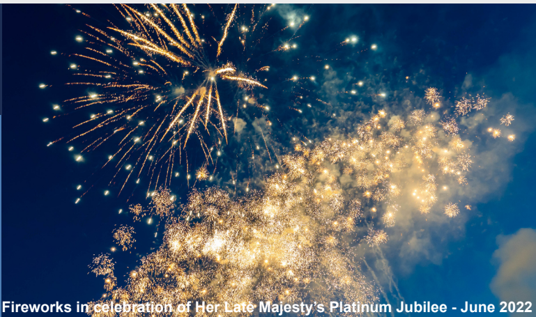
Fireworks in celebration of Her Late Majesty's Platinum Jubilee - June 2022

The Town Council offer further room hire discounts to community organisations. To find out more visit https://www.saltash.gov.uk/facilitiesforhire.php